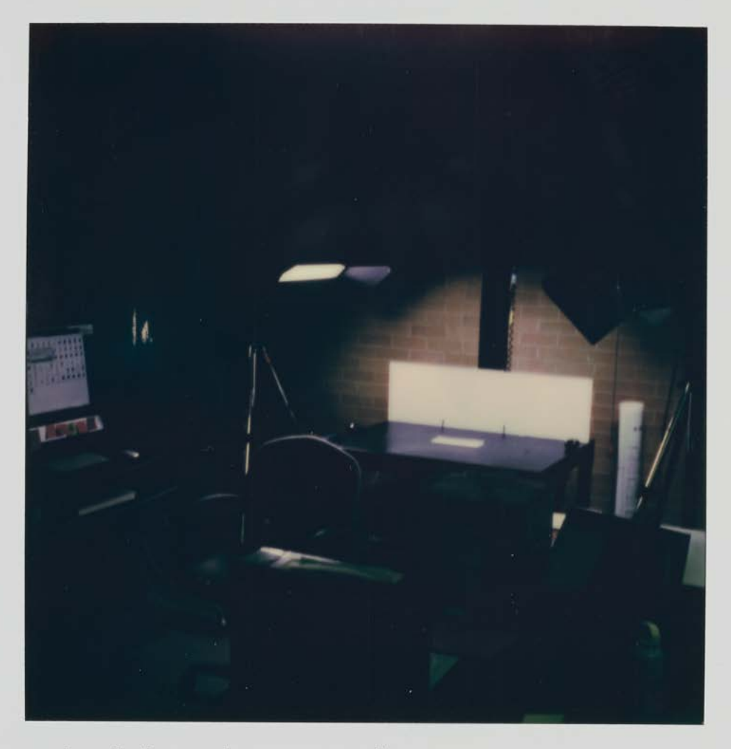
tdl imaging group founded 2019