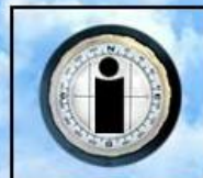
General Info. & About Us