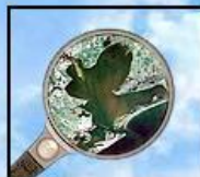
Search & Bibliography