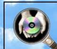
Resources & Services